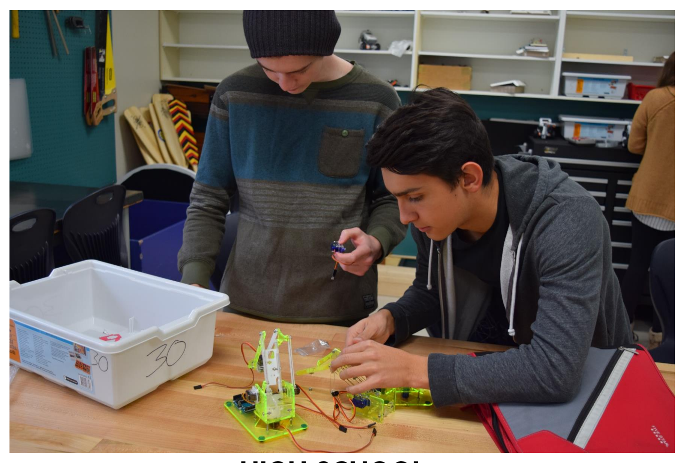
HIGH SCHOOL COURSE SELECTION GUIDE